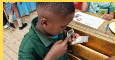
Using the lens to see details on seeds