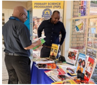
Showcasing PSP resources at the STEAM Conference

Two teachers from PSP's Cluster Project presented: