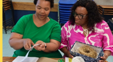
Visual thinking strategy activities