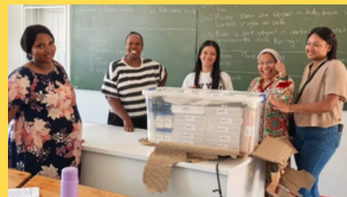
Essential science equipment delivered

This term has seen activity across all our schools. New Maths and Science kits were delivered and workshopped with teachers to promote, engaging, hands-on learning in Foundation Phase to Grade 7 classrooms. All this is made possible through the generous support of our funders.