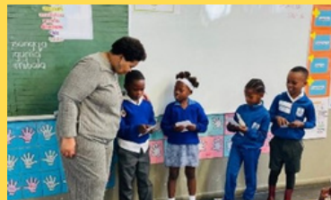
Learners presenting their numbers